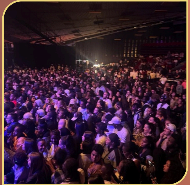
Networking & social experience