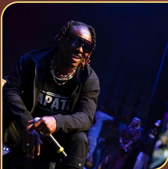
Food vendors (African + Caribbean + Black American)