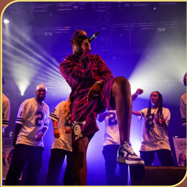
Local and International DJ Sets; Afrobeat, Amapiano, Hip Hop, Reggae